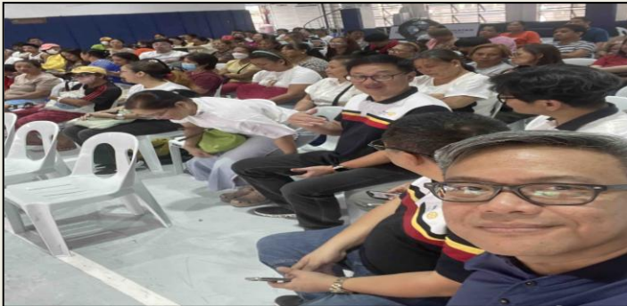
Villagers listening to the Live Christ, Share Christ talk.