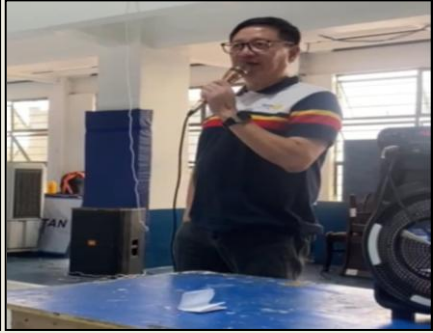
Welcome remarks from Dir Tet, Inspirational message from Pres Dodie