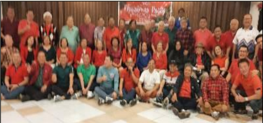
Pasig Rotarians with spouses, our "first" partners in service.