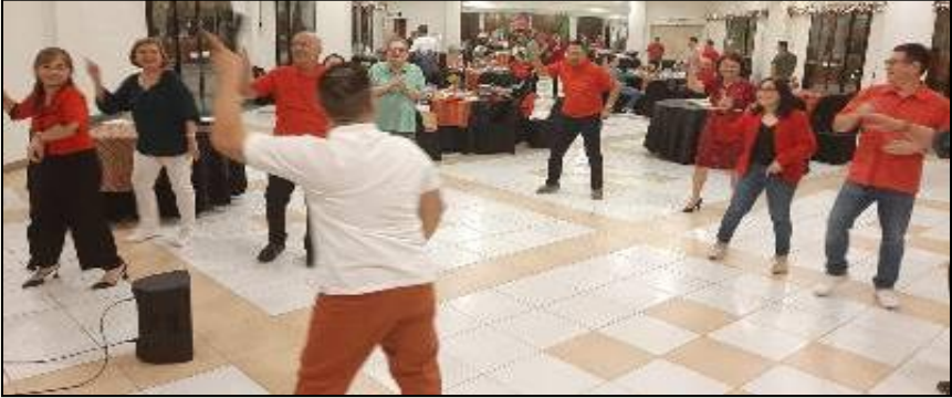
Rtn Doc Ato leading group dancing.