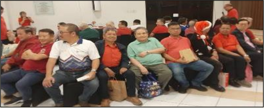
Exchange gift via Trip to J.erusalem.