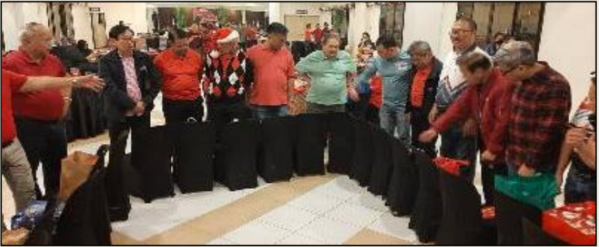
All set to go around.