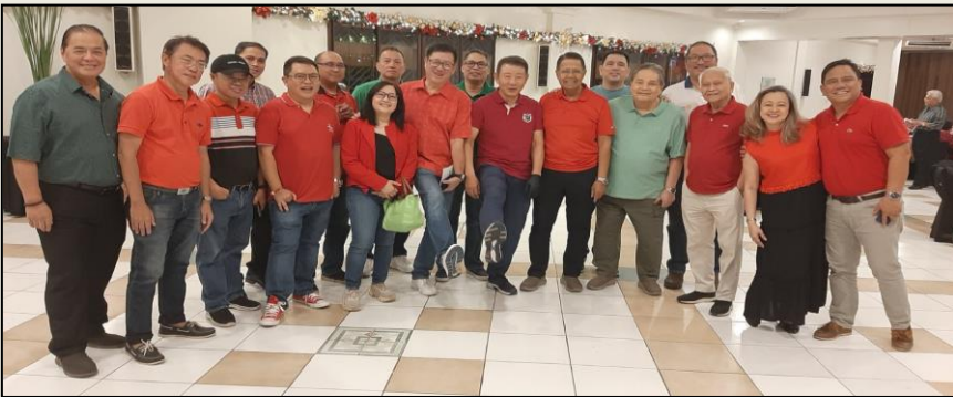
First Ladies Essa & Alu with the Noble Men of RCP.