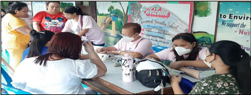
Ilugin's Community Volunteers all out in assisting.

RCP teams up with TMC's Institute for Women's Health, Pasig City Medical Society, Tau Gamma Phi of Pinagbuhatan & NPK Trading.