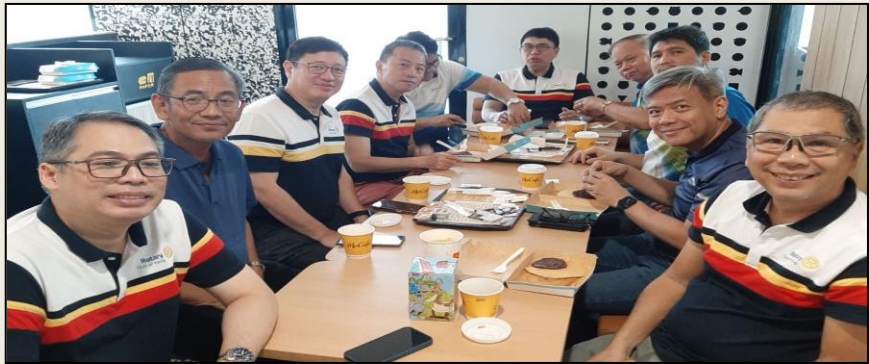
Enjoying Popeyes' breakfast from an anonymous donor after doing good on a Sunday morning!