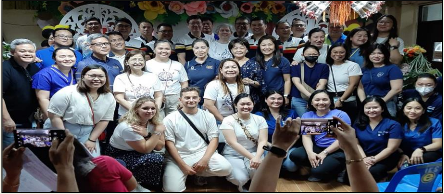
And with the TMC, ASMPH and PCMS doctors.