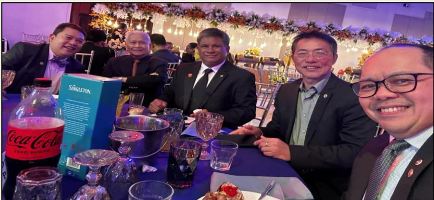
Five PPs with a Singleton to enjoy!