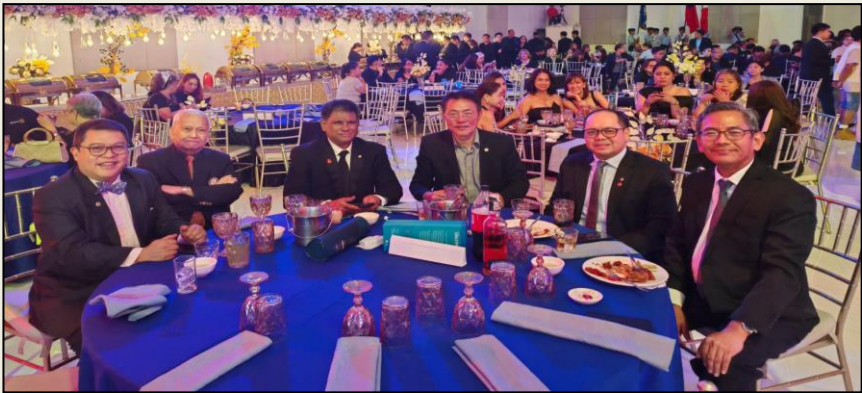
Six Pasig & six Downtown Batangas Rotarians but in separate tables.