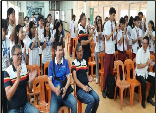
A dance number is applauded by fellow scholars.