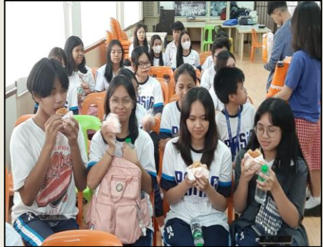
Popeyes burgers for the afternoon snack from PE Roy.