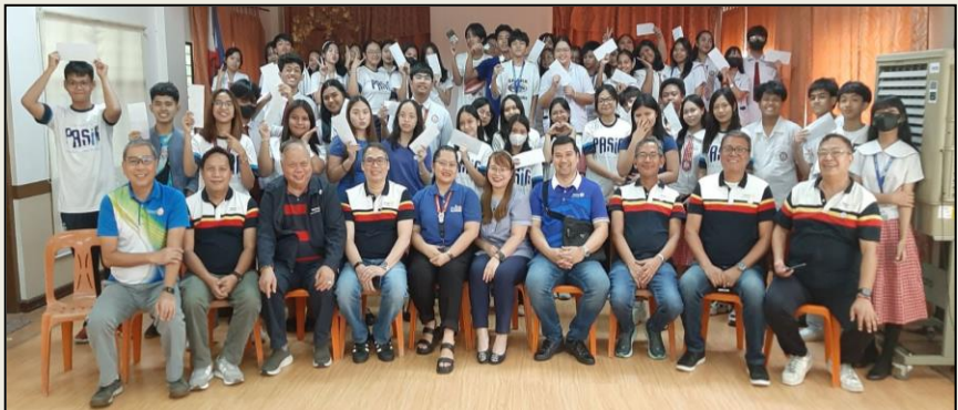
With the 61 scholars of RHS.