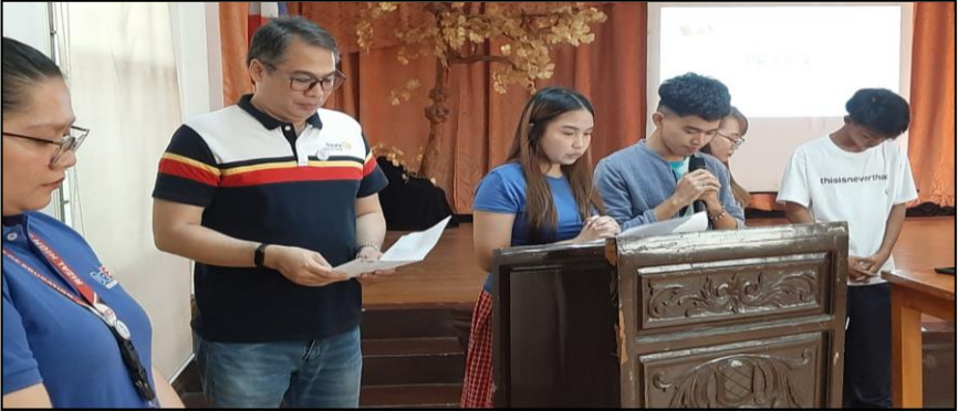
Opening prayers before stipend giving.