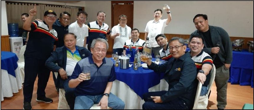
Let the fun begin!