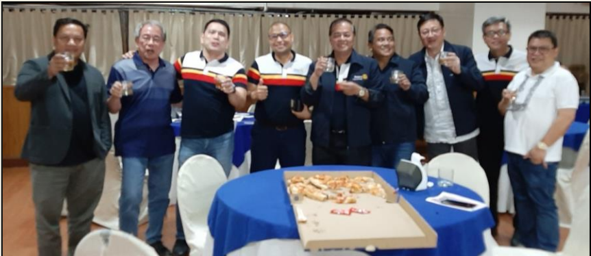
Until closing time kami!