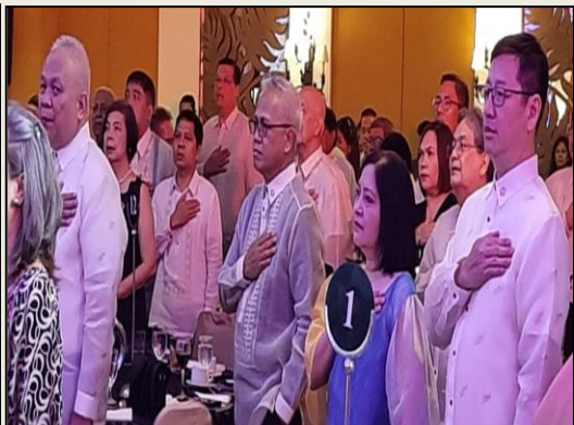
Singing of Pambansang Awit.