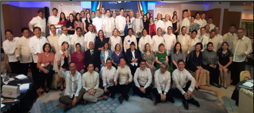
Pasig Rotarians with spouses.