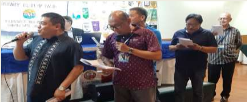
Pangkat 5 quintet sings Batang Bata Ka Pa of Apo Hiking Society.