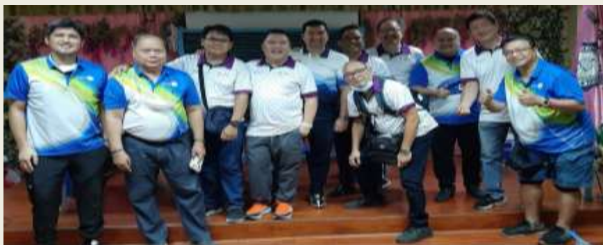
A well spent Sunday morning by 11 Pasig Rotarians.