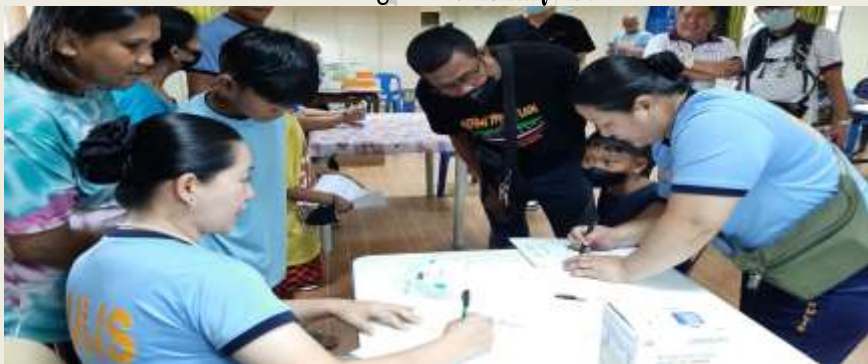
Mom registers son for circumcision.