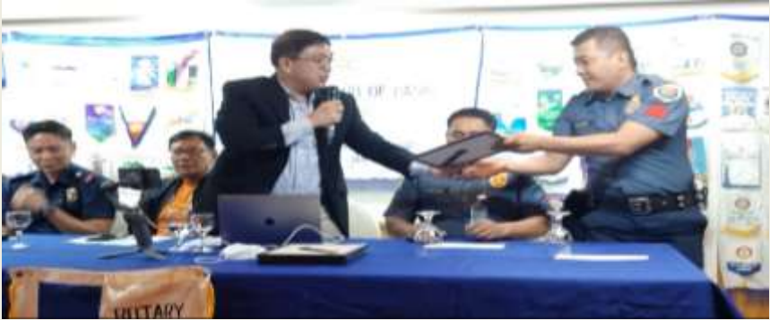
IATP Bong hands out club's token.