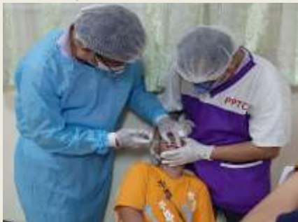
A very busy dental section.