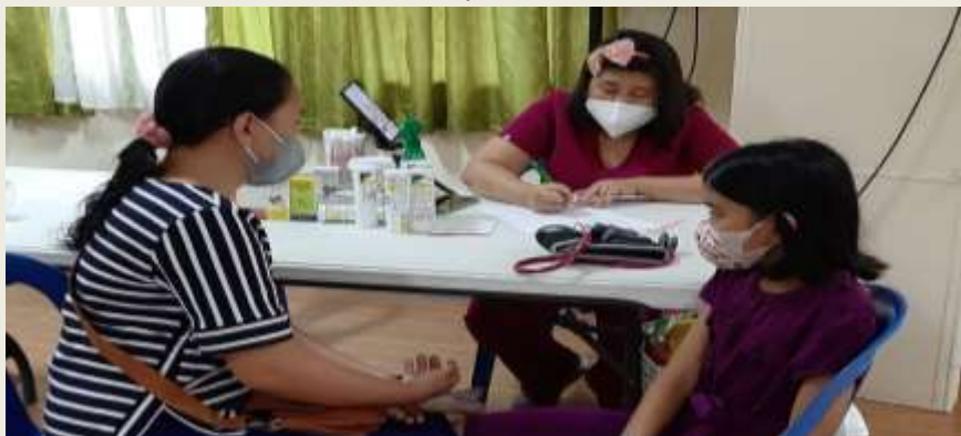
Interviewing a patient.