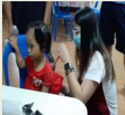
Check up by TMC pediatricians