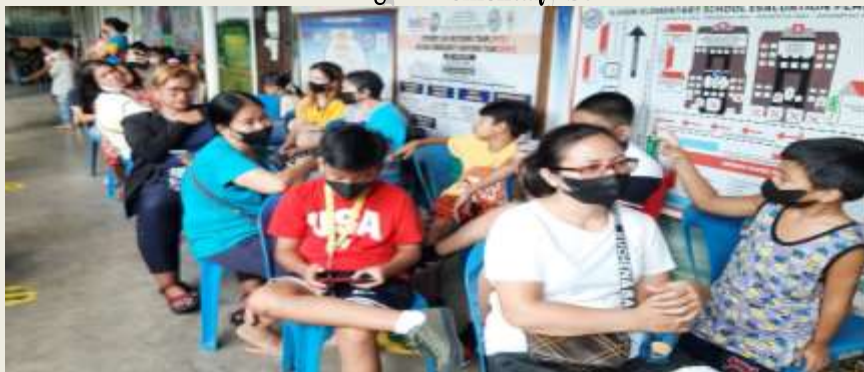
Waiting it out.