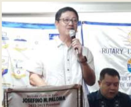
IATP Bong's time. PN Dodie introducing today's guests...