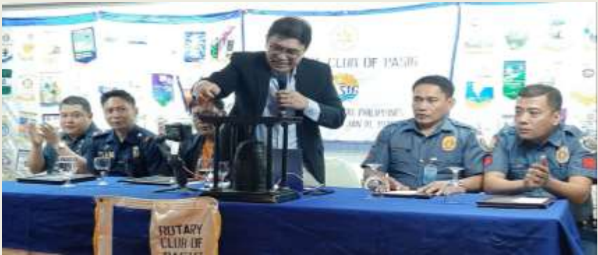
IATP Bong adjourns club's 43rd meeting.