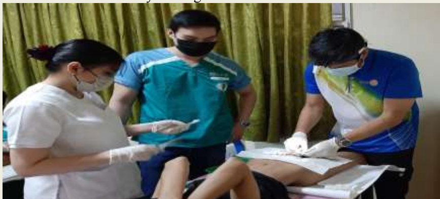
and doing it himself.