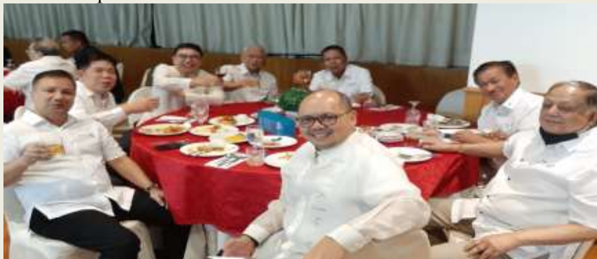
Cheers to all!