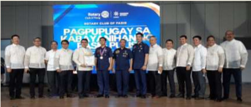
RCP Officers & Board with PMGen Okubo, PBGen Asueto & PCol Sacro