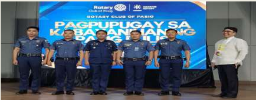
IATP Bong with second time awardees.