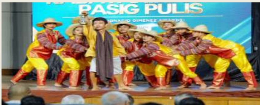
Interpretative dance number by KKDAT Pasig.