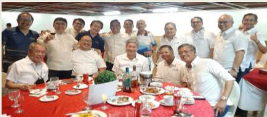
We're all Pasig Rotarians!