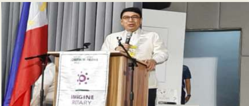
Closing Remarks by IATP Bong.