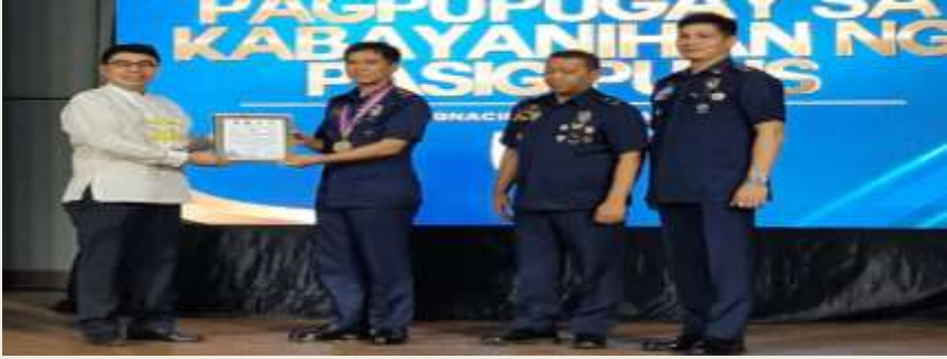
IATP Bong receives Plaque of Appreciation for RCP from Pasig PNP from PMGen Okubo.