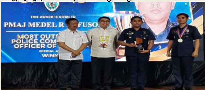
Most Outstanding Police Commissioned Officer.