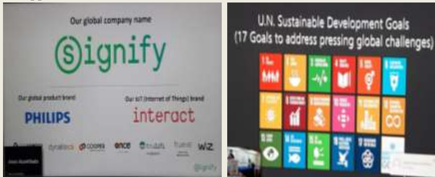
His talk is on Sustainability of Solar Streetlighting: