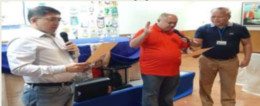
Oath of membership is handled by IATP Bong.