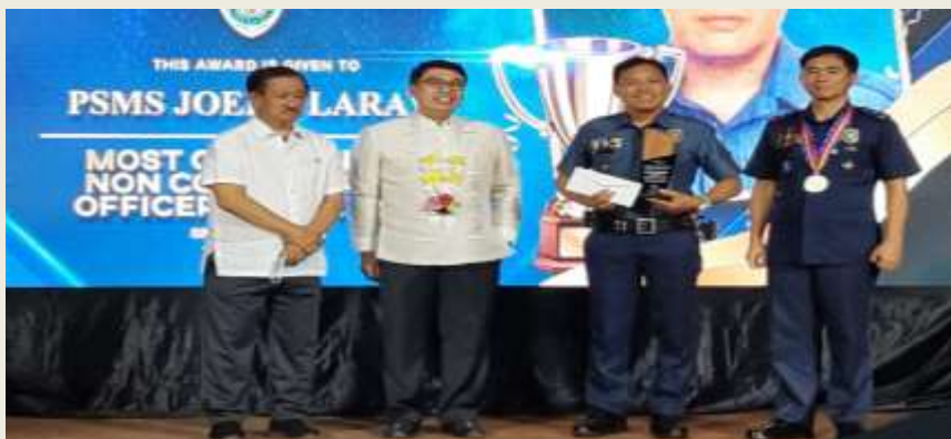
Most Outstanding Non-Commissioned Police Officer.