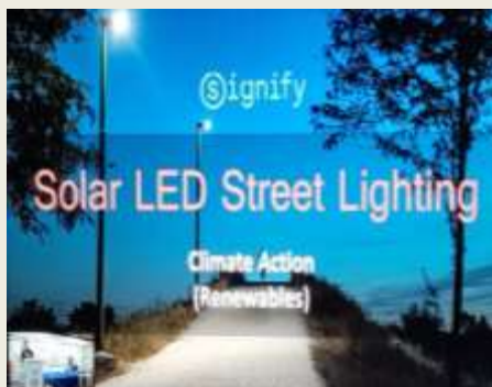
Solar for Free Electricity & for Disaster