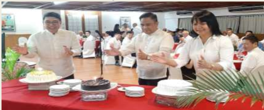
Candle blowing time on 3 birthday cakes!