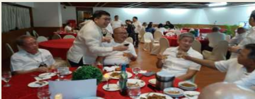
It's toasting time!