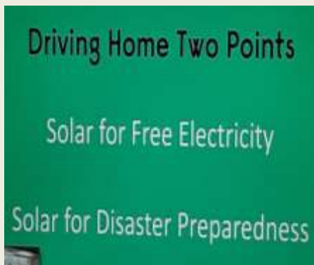
Preparedness featuring experiences in Solar street lighting projects