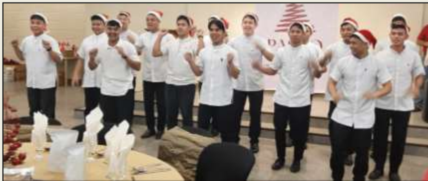
St. Camillus seminarians sing to the members & guests.