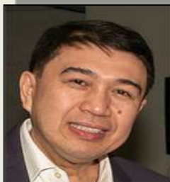
IPP Bong Paloma