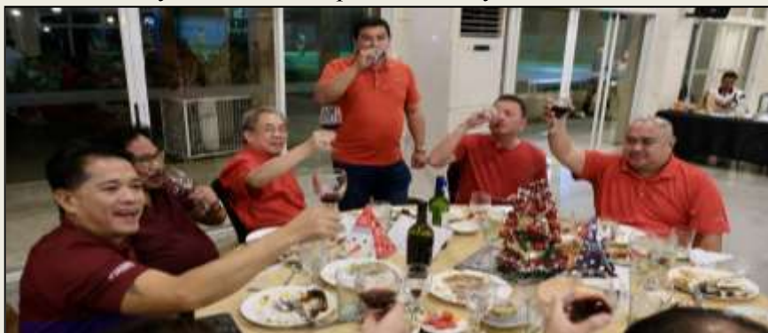
A toast for the holidays!