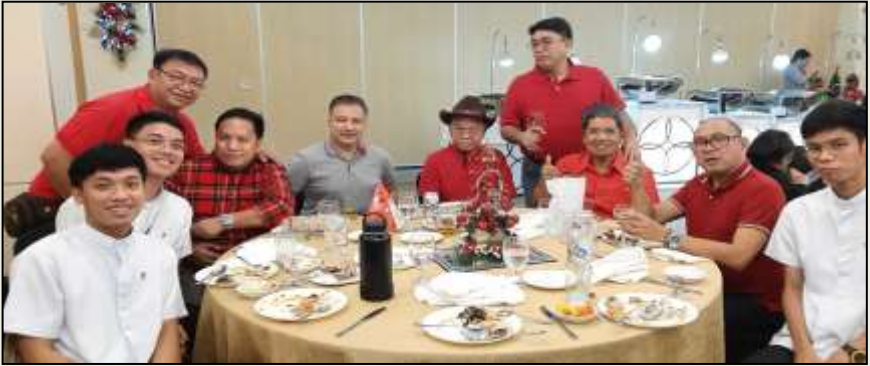
Noble Men with seminarians from St. Camillus.