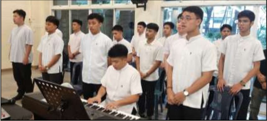
Choir are seminarians of St. Camillus Seminary.