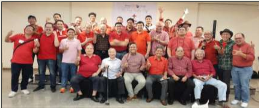
A group photo of the Noble Men of RC Pasig.