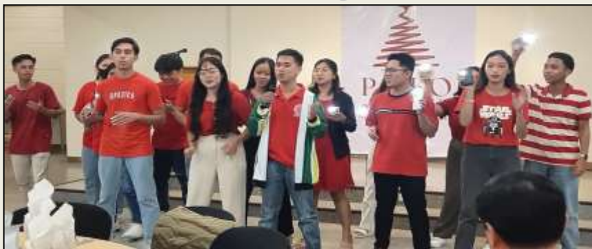
Performing are Rotaractors of Pamantasan ng Lungsod ng Pasig.