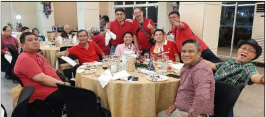
Nine jolly Noble Men.