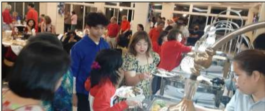
A buffet dinner of laing, chicken pastel, bangus & kare-kare.