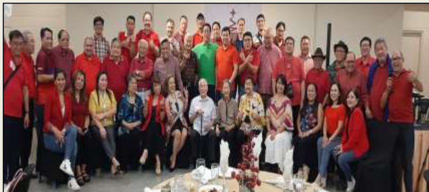
And with the spouses!