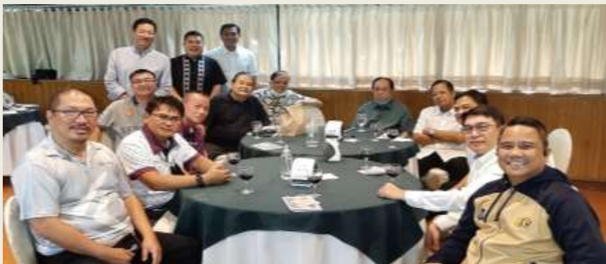
A special meeting on members' attendance.