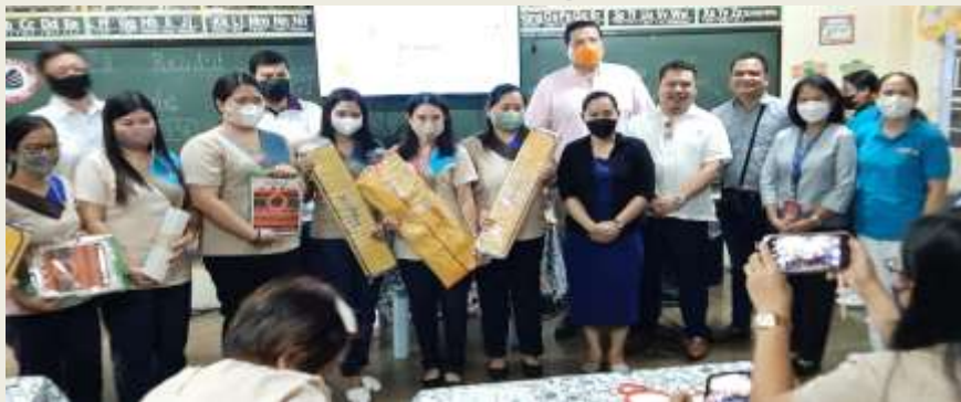
Teachers show their Learn-To-Read training aids.