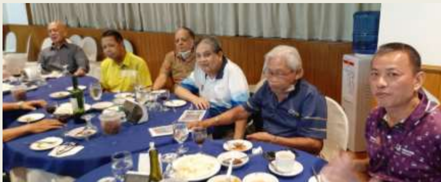
including the club oldies!