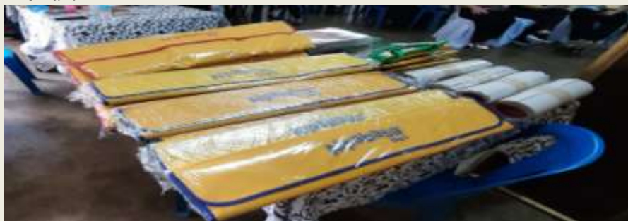
ALPABASA's Learn-To-Read Training Aids.