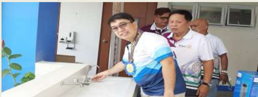
IATP Bong trying out handwashing station.