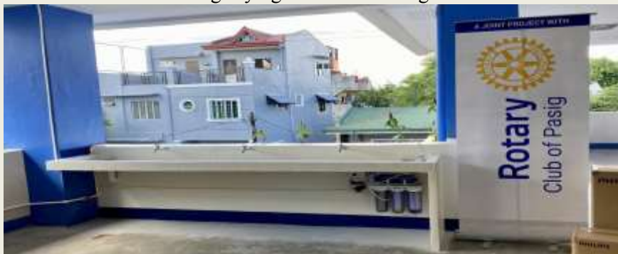
Newly installed handwashing station.