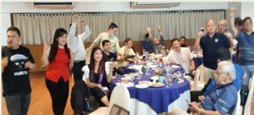
So very happy we all are!