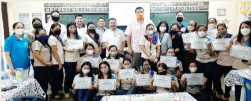
Proudly displaying 35.