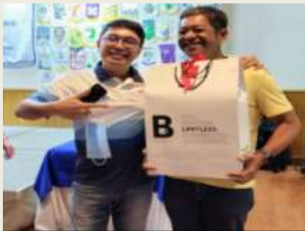
It's raffle time! Bebert wins a coffee maker!