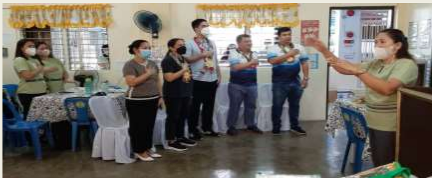
Program starts with singing of Pambansang Awit.