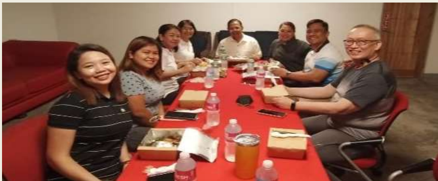
Lunch with Asador's Inasal!