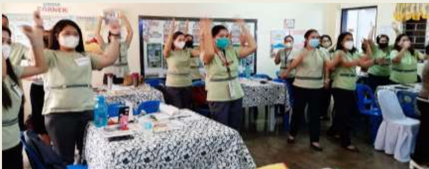
Start up energizer by the teachers.