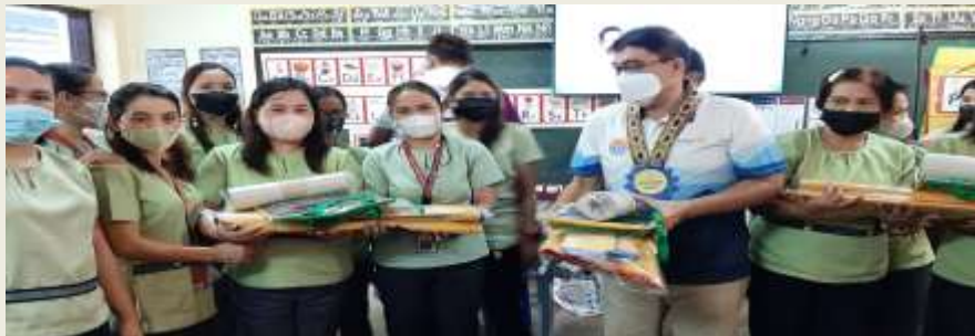
IATP Bong handing out Training Aids to K-3 teachers.