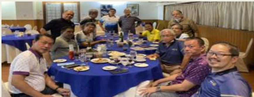
All ready for a night of singing, drinking and bonding...