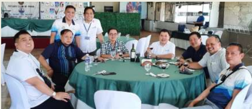
Nagpaiwan for more chit chats, wine & chicken inasal.