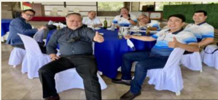
Naiwan pa sila for the early happy hour!