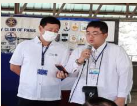
First time message before members. Rtn Rod introduces...