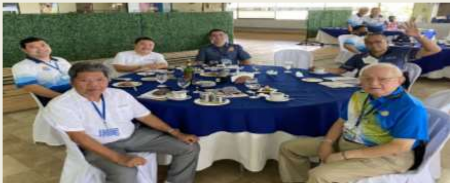
The newbies and the oldies!