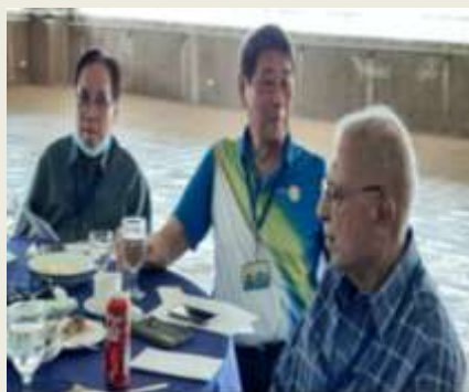
Yung malayo pinangalingan at yung sa tabi tabi lang!