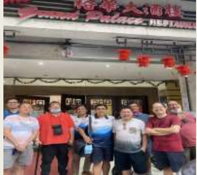
Prawns & scallops after the pigeon. Busog na kaming lahat!