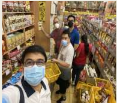
It's buying time for Chinese delicacies.