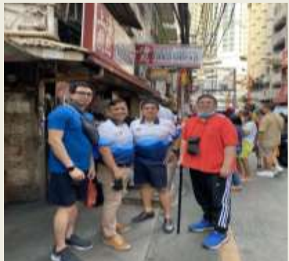
It's buns tasting time! All ready for fried siopao.