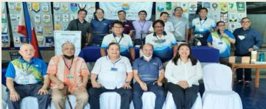
Group photo with f2f attendees.