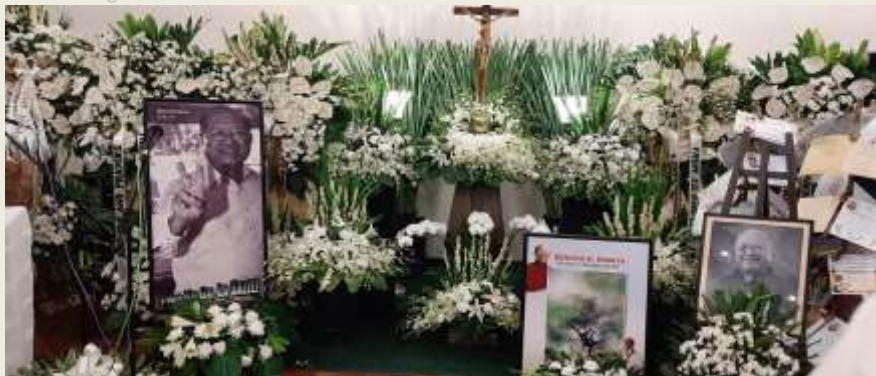
Necrological service for HOF/PP Rhett starts...