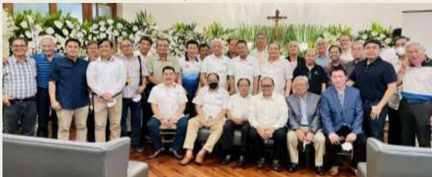
Pasig Rotarians at the necrological service.