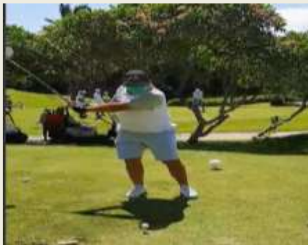
Ceremonial tee off by LCP Garrick & IPP Rj.