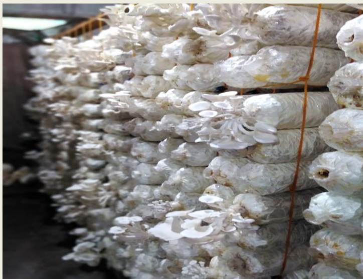
Mushrooms ready for harvest