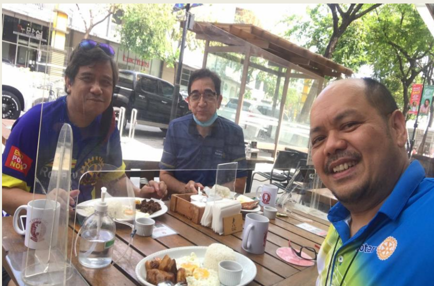
Enjoying breakfast at Tipsy Pig after the early Sunday morning ocular inspection