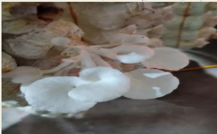
Low cost corn substrate for producing mushrooms