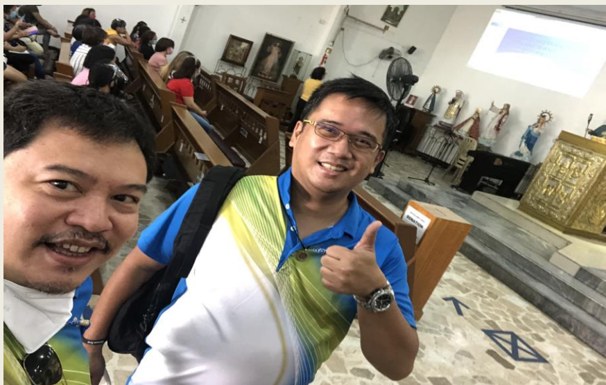
Thumbs up from the Rotarian parish priest!