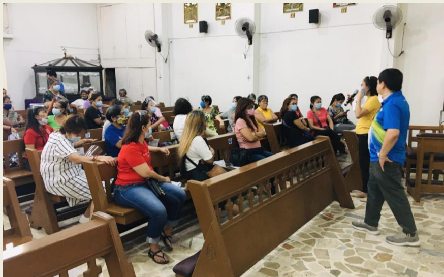
Parishioners of San Guillermo Parish in Bgy. Buting