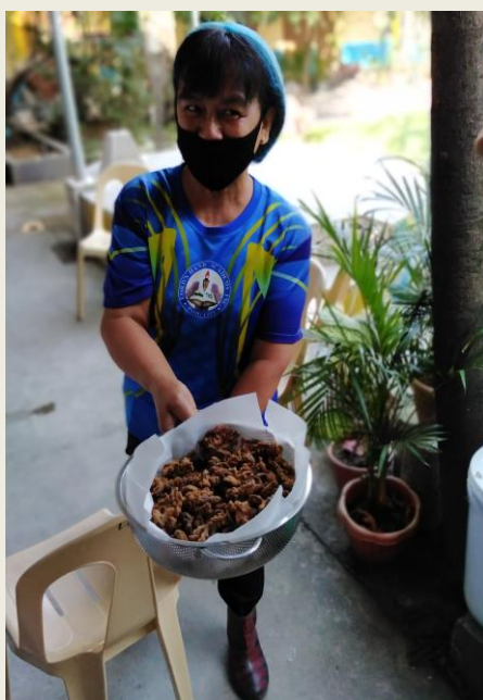
Tasting mushroom chicharon