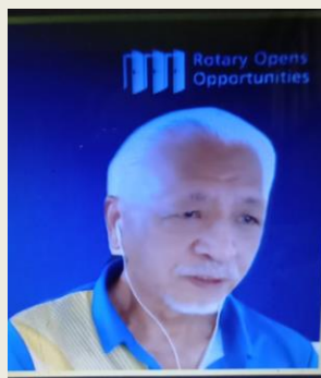
More questions from... PE Bong and PP Topax