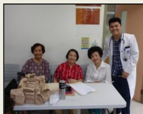
ASSOCIATION ROTARY ANNS OF PASIG Ampon Puso Partner in Service