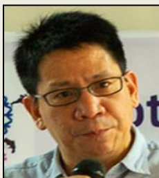
ROMAN T. ROMULO CONGRESSMAN, PASIG