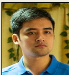
VICTOR MA. REGIS N. SOTTO MAYOR OF PASIG