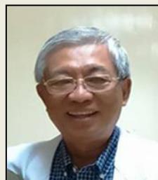
ENRIQUE T. ONA SECRETARY. DOH