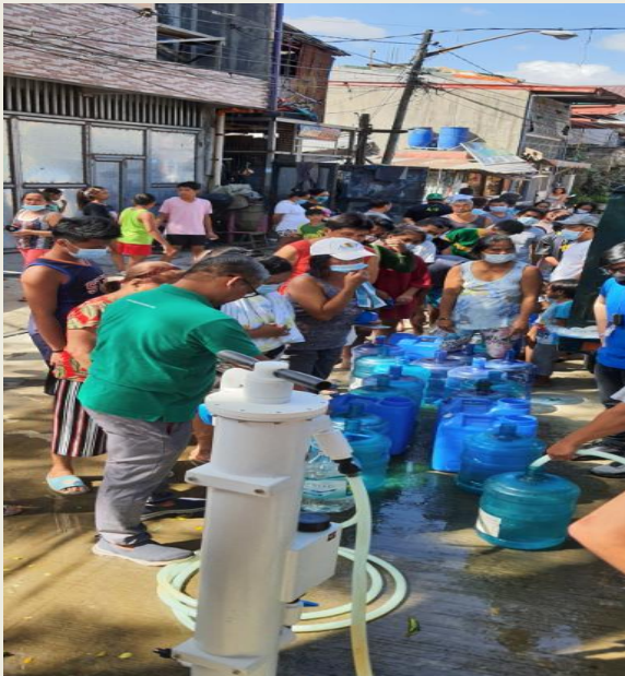
A long queue of villagers thirsting for drinking water