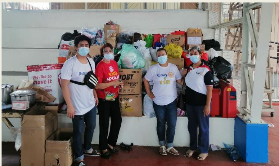
RCP relief goods arrived at the Marikina Relief Center