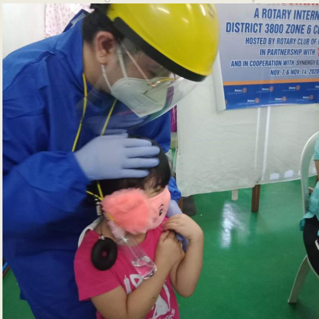
A comforting hug from Doc