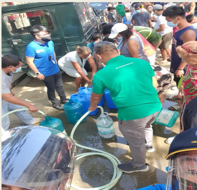
A lot more of containers to fill up!