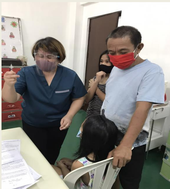
“Parang kagat lang iyan ng langgam,” says Dad assuring daughter