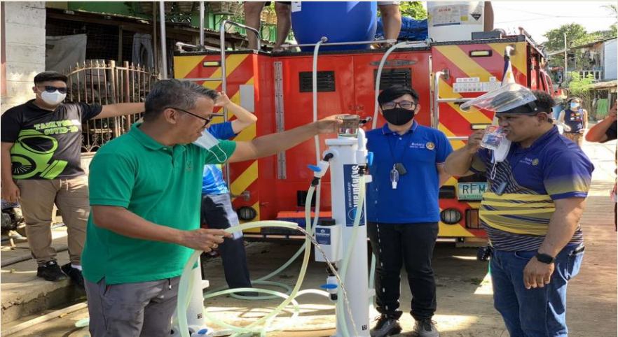
PP Ramy tasting first the water from the SkyHydrant