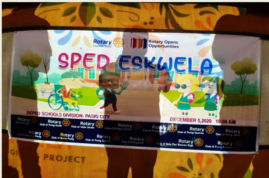
Gift Giving to Special Education (SPED) students at Nagpayong Elementary School