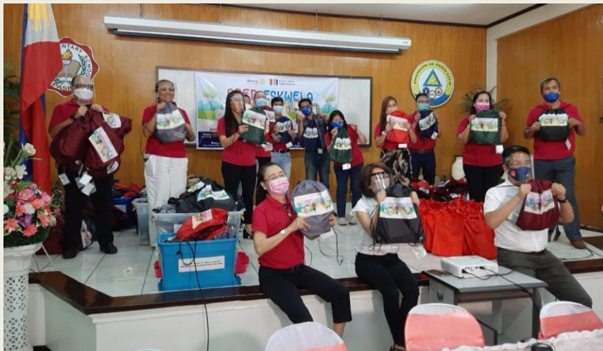
TP RJ with Zone 6 Transforming Presidents display knapsacks of assorted colors