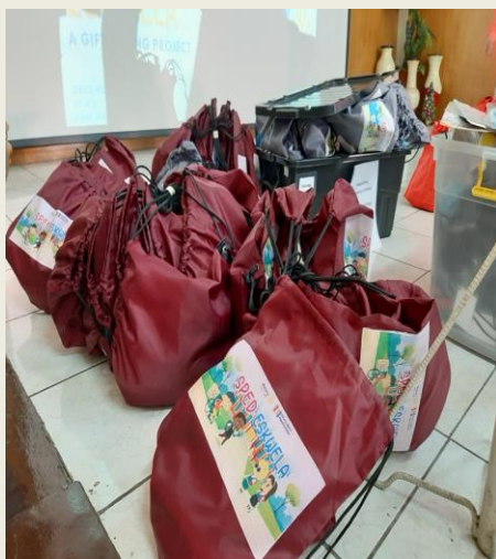
Knapsacks containing Coloring books, crayon, hygiene kit, toy